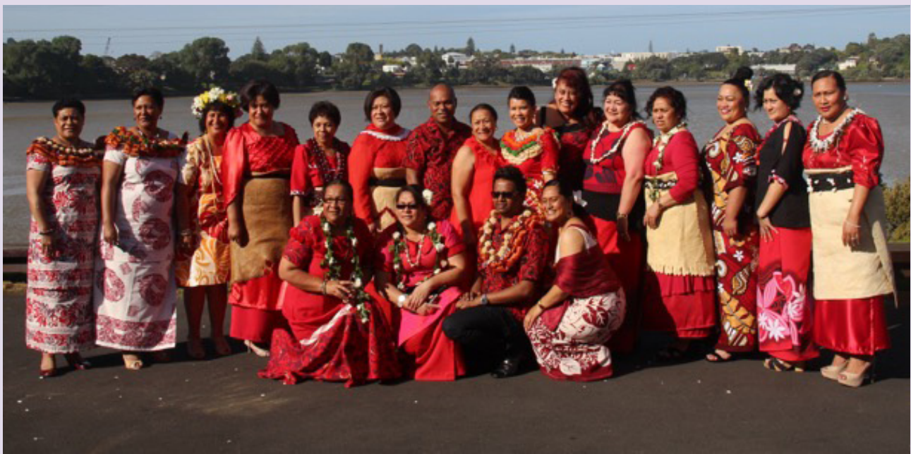
Aniva students represent the diversity of Pacific cultures in New Zealand

ISBN: 978-0-473-40228-0 978-0-473-40229-7 (PDF)