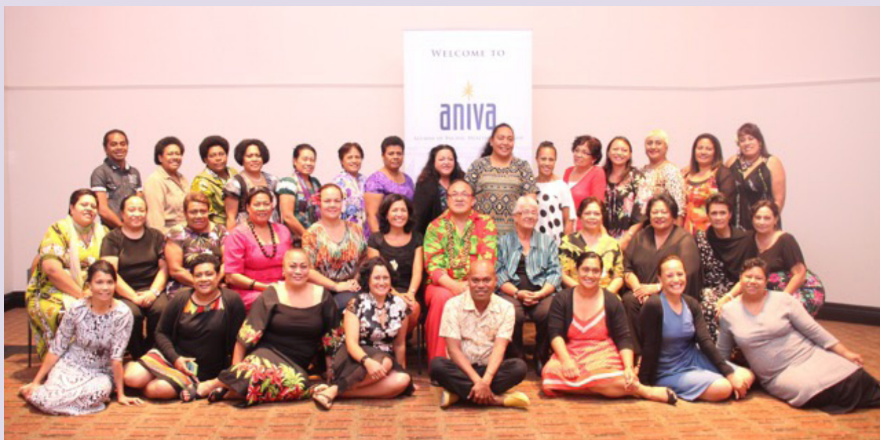
2015 Postgraduate Certificate and Postgraduate Diploma students

Malo faafetai, malo au'pito, meitaki maata, vinaka vaka levu, fakafetai, fakaauae lahi to the following people for their contribution to the programme: